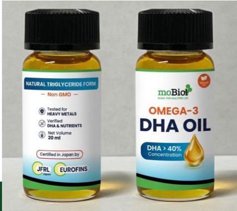
20 ml Vial

Mobiol provides end-to-end API (Active Pharmaceutical Ingredient) solutions, delivering premium-grade DHA Oil ready for industrial use.