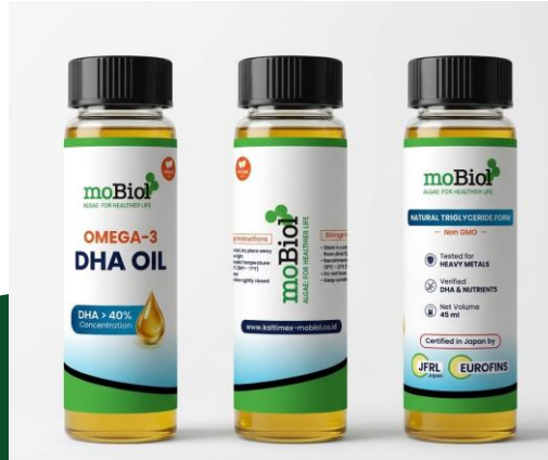
45 ml Vial