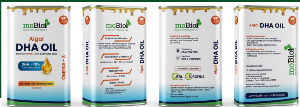
18 Litres Container